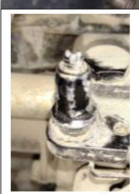
With cap off

3. Check full throttle RPM on a hard packed road. RPM should be 3600. Engine must be warm. If needed adjust the high speed throttle stop. Gently remove the cap on the high speed adjustment. While prying up with a thin blade place a screwdriver in the slot and pull up.